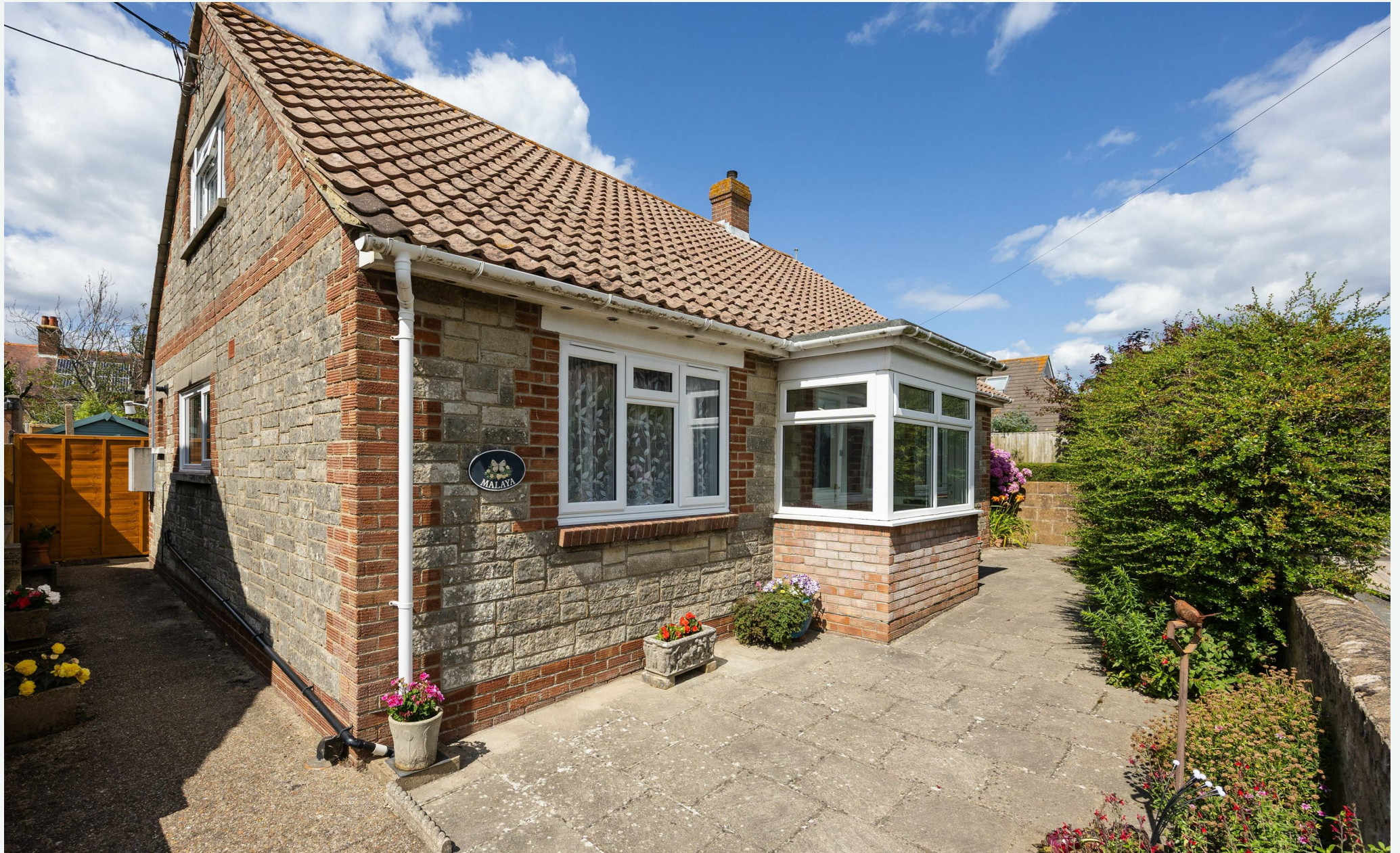
Malaya, Yarmouth, Isle of Wight